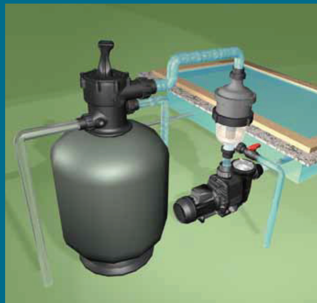
Image shows MC16 GEN2 installed.