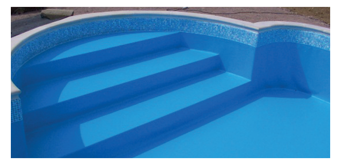
Adriatic Blue and Mosaic tileband

★ Only available while stocks last ★★ Also available in 0.5mm (20 thou)